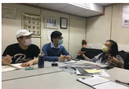
Conducting an interview with a member of the community 與社區人士進行訪談