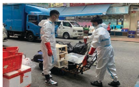
Participating in community service 參與社區服務