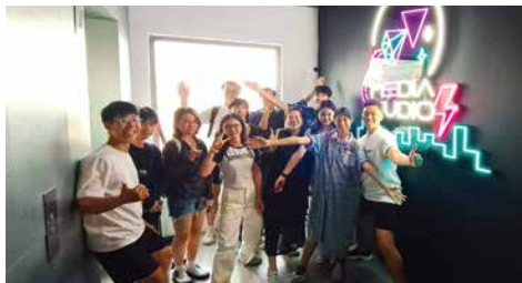
Students attended a sharing session on AI and Transformations in entertainment and PR Industry.