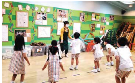
Teaching practice in a kindergarten 幼稚園教學實習