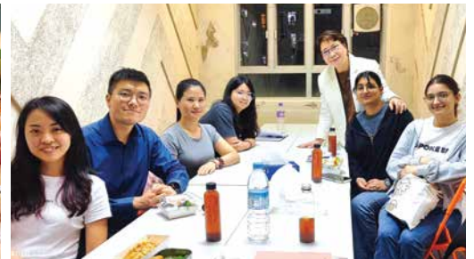
Student representatives participated in the consultation meeting held by the School every semester 學生代表參與學院每學期為學生舉辦之諮詢會議