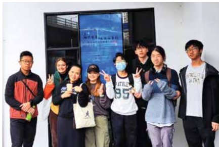
Students participated in an international symposium 學生參與國際研討會

學生需完成兩次各80小時的駐校體驗(合共160小時)、教學實習(8星期,共360小時)及實習工作坊(42小時)。