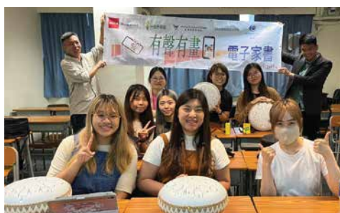
Students participated as volunteers in the activity of "Audio-Visual Electronic Family Letters" 學生參與「有聲有畫電子家書」活動之義工