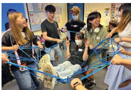
Methodist Centre's School Outreach Service - Volunteer Training 循道衛理中心入校服務 - 義工培訓