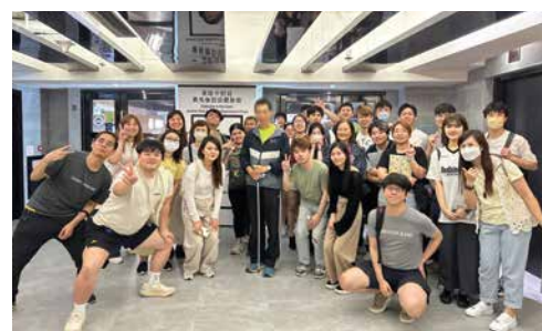
Stepping out of the Classroom - Experiential Activity at the Dialogue in the Dark Exhibition 課堂以外學習 - 黑中對話體驗館進行體驗活動