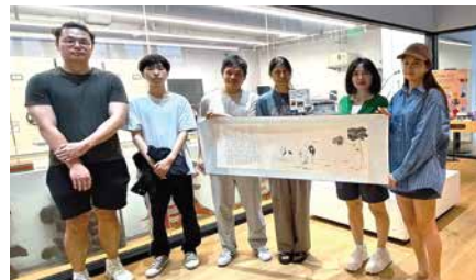
Students attended a seminar on design and intangible cultural assets preservation with community engagement in Hong Kong Design Institute.