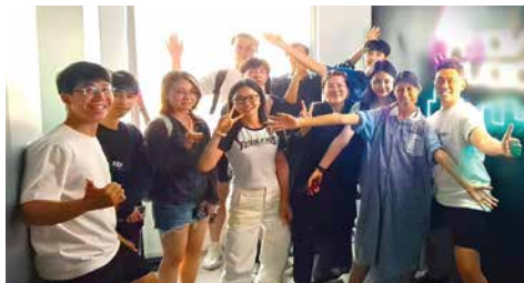
Students attended a sharing session on AI and Transformations in entertainment and PR Industry.