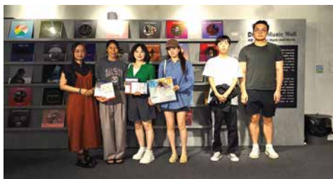
Students participated in an Industry Visit on Innovations, Transformations and Quality of Services 2024.

畢業生亦可報讀宏恩基督教學院的服務管理榮譽學士課程三年級，或報讀其他院校開辦之相關領域的銜接學位課程。