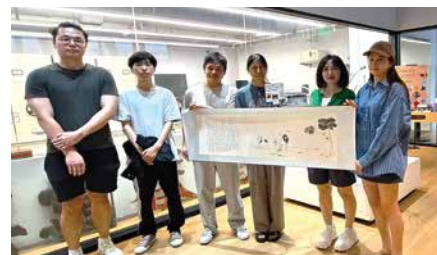
Students attended a seminar on design and intangible cultural assets preservation with community engagement in Hong Kong Design Institute.