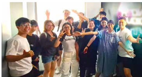
Students attended a sharing session on AI and Transformations in entertainment and PR Industry.