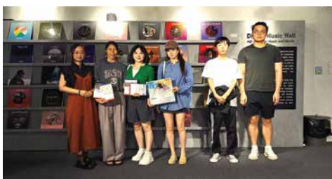
Students participated in an Industry Visit on Innovations, Transformations and Quality of Services 2024.

畢業生亦可報讀宏恩基督教學院的服務管理榮譽學士課程三年級，或報讀其他院校開辦之相關領域的銜接學位課程。