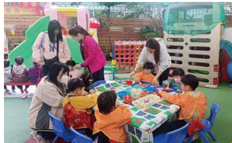
Teaching practice in a kindergarten 幼稚園教學實習