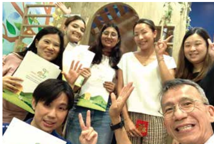
Students visited a Child Therapy Centre 學生參觀兒童治療中心

學生需完成兩次各80小時的駐校體驗(合共160小時)、教學實習(8星期,共360小時)及實習工作坊(42小時)。